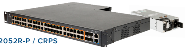
EX2052R-P / CRPS