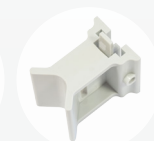
Pole mounting bracket